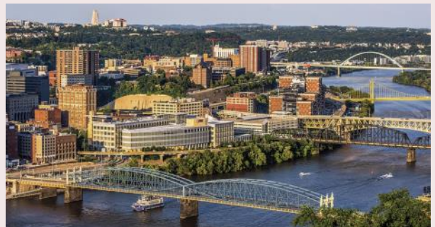
Pittsburgh: City of Bridges

Hotel: The Westin Pittsburgh -conference rate $209 per night