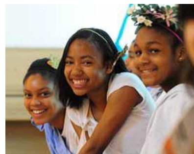
Book to Bravo