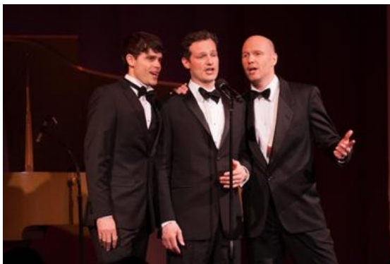
Canadian Tenor Trio Romanza