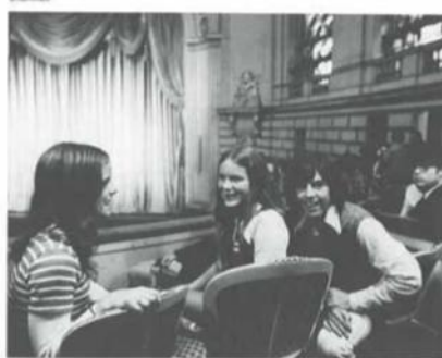
Students attend the Opera Guild's 100th Student Matinée in 1973 - La Traviata.

"It's never too early to encourage children to express themselves and explore their creativity. Breathing life into art - and teaching children that they, too, can be actors, creators, thinkers and visionaries - are key to our organization's most important missions."