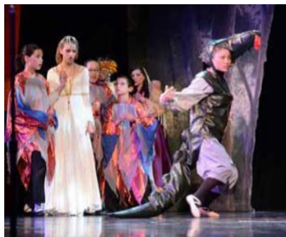
Summer Conservatory