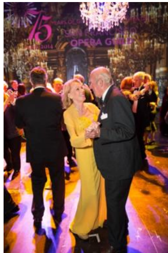
Charlotte Shultz and The Honorable George Shultz