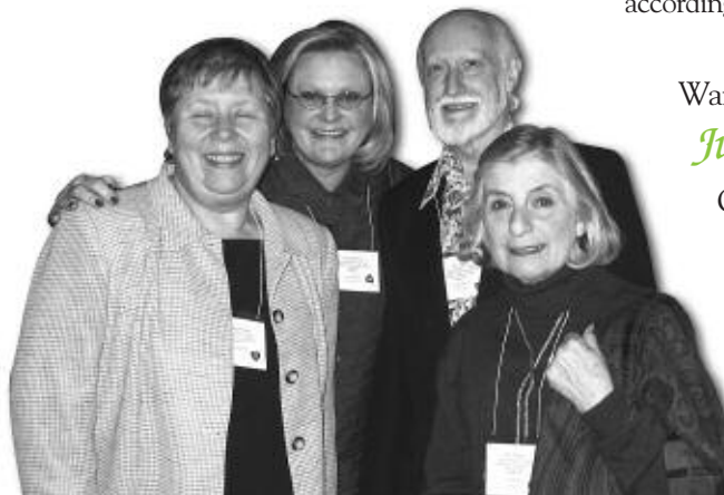
"The Chicago gang"