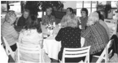
Conference Delegates from the Central Region

The Central Region coordinator was unable to attend the table discussion, but a lively discussion did ensue (after all, this region was hosting the Conference! Unfortunately notes disappeared, as they can all too easily do.