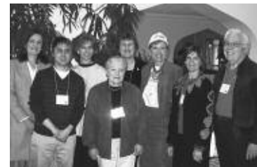
Conference Delegates from the Mountain Region