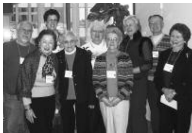
Conference Delegates from the Pacific Rim

Finally, there was discussion of where there might be interest in holding the next Conference or a Regional Meeting. There was interest expressed by both Los Angeles in California, and Anchorage in Alaska in holding a future Regional Meeting, and that was passed on to the OVI board who will work with the various groups offerings to select the best time and place.