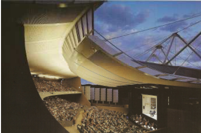
The Crosby Theatre of The Santa Fe Opera

While the days are warm, it can sometimes be a bit chilly at the Opera by the time a show finishes at 11:30pm or midnight! Although, mid-July is still a bit early, the "monsoon" rains often bring intense but cooling thunderstorms in the late afternoon. Be prepared by bringing layers of clothing and/or a blanket! A performance at the 53 year-old Santa Fe Opera is about more than the singing and the music. We shall be in the third theatre constructed on this site, although this modern facility, completed in 1998, retains many of the features of the very first 500-seat all-wood theatre which opened in 1956.