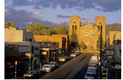
The Basilica in downtown Santa Fe

Be aware that the city is located at 7,000ft. Summer days can be very warm, getting close to 90F, but the nights are generally wonderfully cool. First time visitors are advised to take it easy for a day or two to adjust to the altitude and the plentiful sunshine. Bring sunscreen, wear a hat, and be aware that a couple of alcoholic drinks can be the equivalent of imbibing lots more at a low altitude! Above all, keep drinking water! Due to our very low humidity, a regular supply of drinking water is important to have with you at all times!